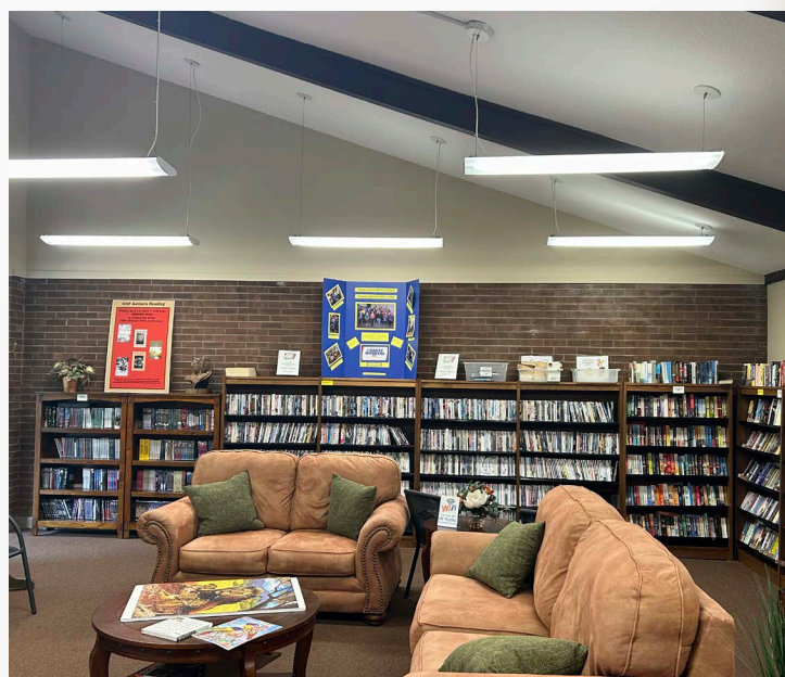
A good book pairs well with a comfortable seat