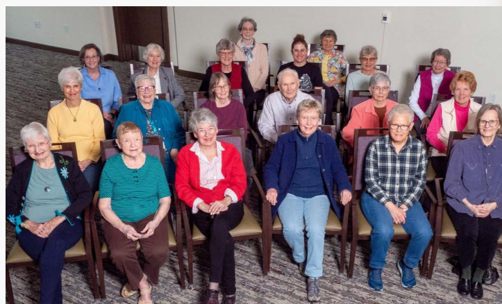
These are most - but not all - of the dedicated volunteers who steer the library