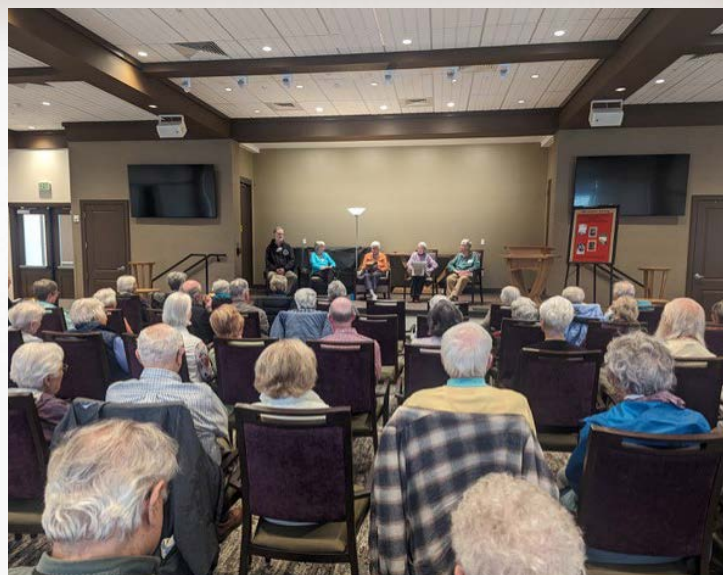
The Library Committee involves the entire community

The earnest and humble beginnings gained momentum, including in 1980 with an active Library Committee, in 1982 the Residents Council started funding, and 2011 saw the expansion to the current three rooms. In 2017, the Library Committee implemented a computer program to manage the cataloging and circulation. The Residents Council provided financial support for many years, but when Givens Communities obtained Givens Highland Farms it started funding the library and other resident activities. In 2020, a Library Management Team was installed to replace the original Library Committee. More recent efforts include the Library2Go project, with resident volunteers taking carts of books and magazines to residents of the Givens Highland Farms Health Care Center and Prentice Lodge.